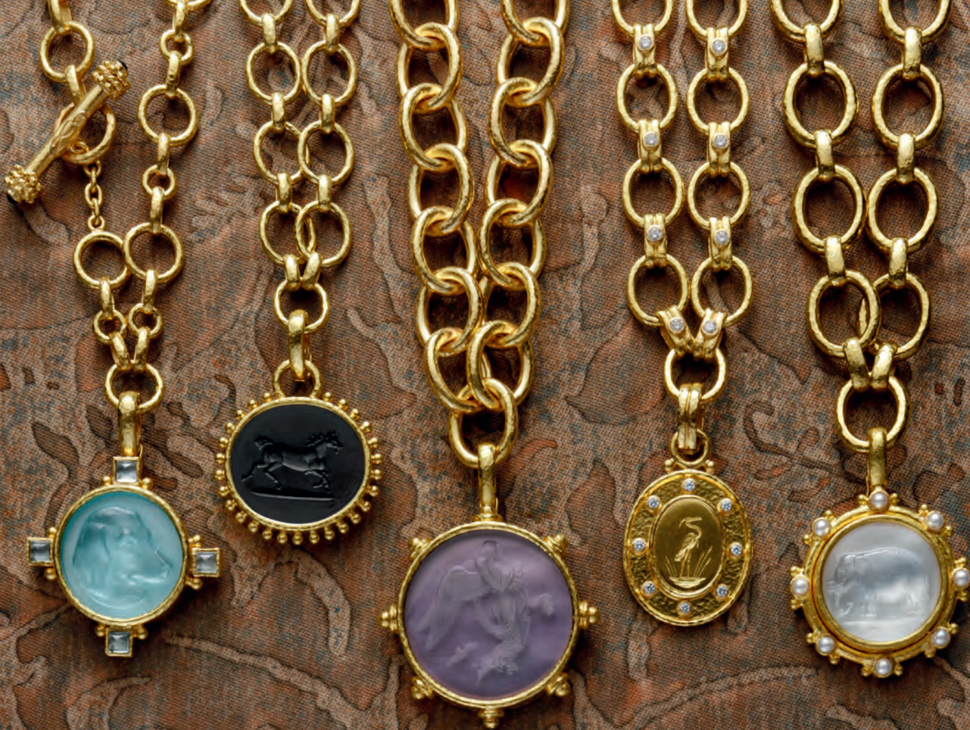
Siena necklace with light aqua Venetian glass intaglio pendant N 53906 & P 88026-V Positano necklace with onyx intaglio pendant N 97157 & P 70440 Volterra necklace with mulberry Venetian glass intaglio pendant N 21427 & P 66633-X Diamond Rimini necklace with gold and diamond pendant N 88756 & P 93821 Smooth Link necklace with crystal Venetian glass intaglio pendant N 18825 & P 93166-P