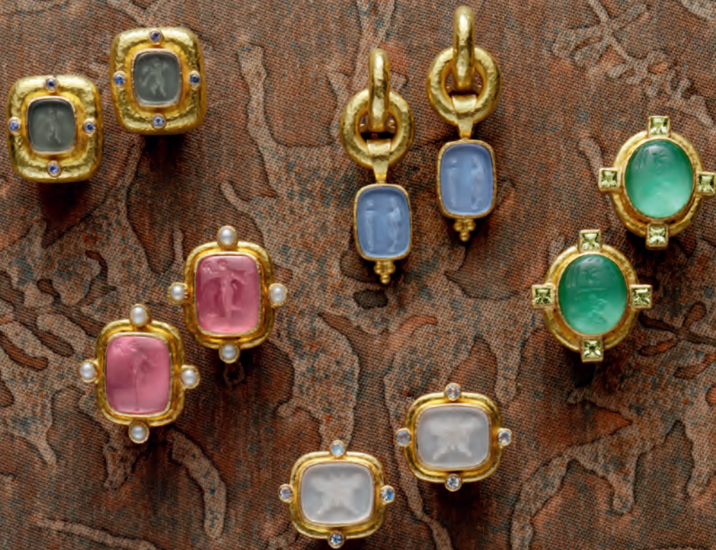
Smoke Venetian glass intaglio earrings ER 75959-S Cerulean Venetian glass intaglio Cheerio earrings ER 7625-L Pink Venetian glass intaglio earrings ER 91598-Z Nile Venetian glass intaglio earrings ER 84617-F Crystal Venetian glass intaglio earrings ER 78982-P