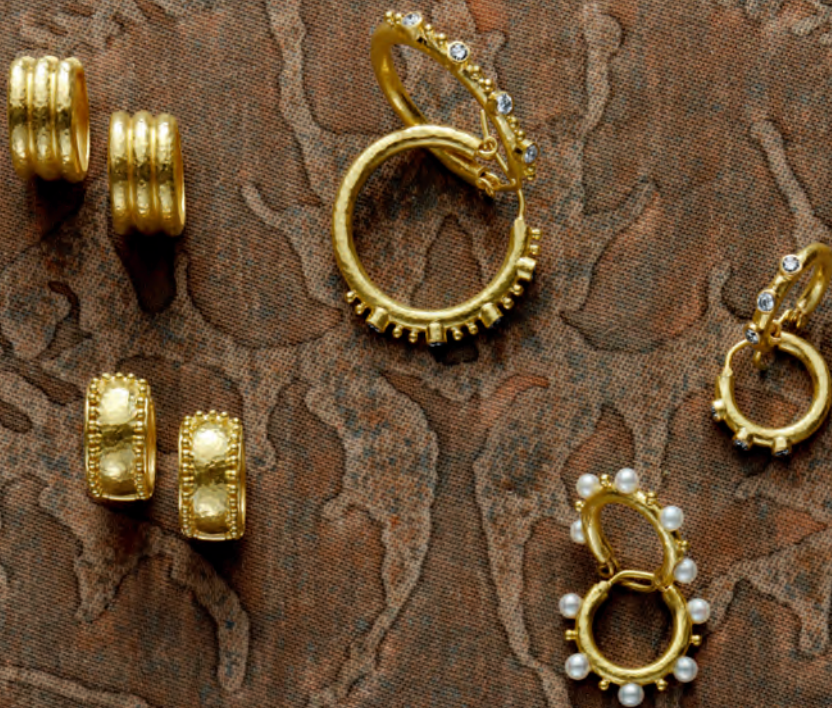
Banded hoop earrings ER 12677 Giant diamond hoop earrings ER 66592 Big Baby hoop earrings with diamonds ER 93407 Granulated hoop earrings ER 7526 Big Baby pearl hoop earrings ER 99120