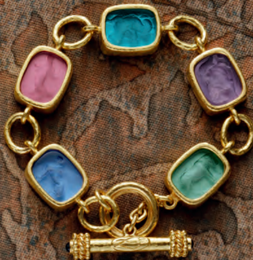
Venetian glass intaglio bracelet in fall colors BR 87986-A Volterra bracelet BR 90793 Heavy Oval Link bracelet BR 2343 Venetian glass intaglio bracelet in bright colors BR 12130-Z