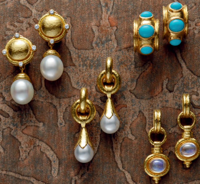
Diamond and South Sea pearl earrings ER 100494 Sleeping Beauty turquoise earrings ER 80025 South Sea pearl Cheerio earrings ER 98487 Moonstone earrings ER 92080