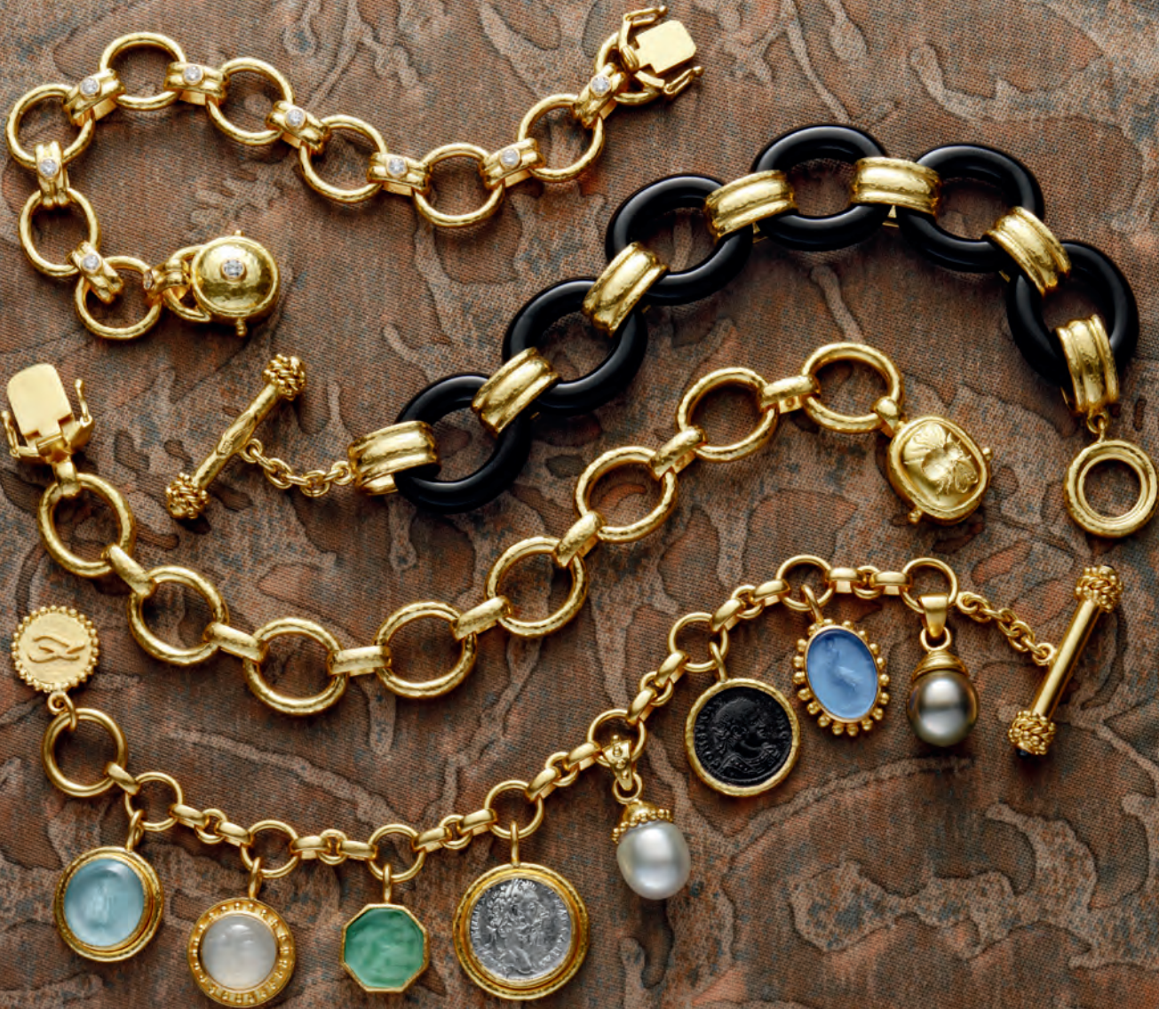
Diamond Rimini bracelet BR 93831 Black jade bracelet BR 76123 Smooth Link bracelet with Bee clasp BR 90794 Tiny charm bracelet BR 1386