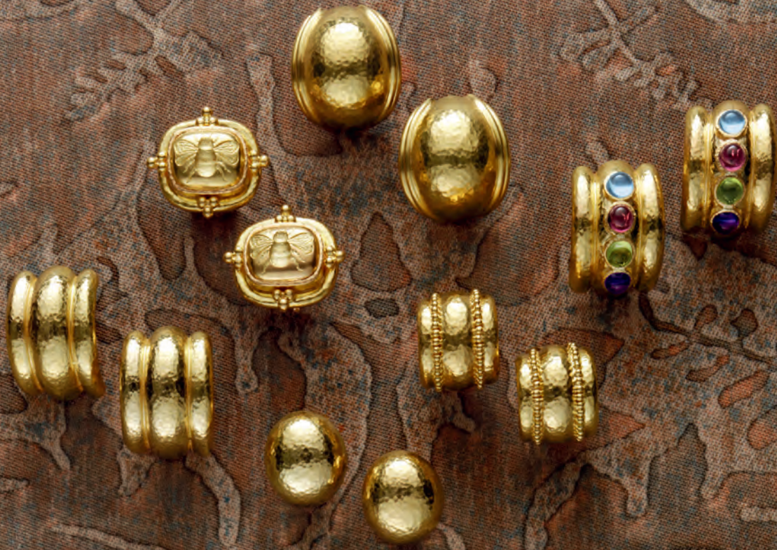
Gold Fat Bee earrings ER 18046 Gold Puff earrings ER 10844 Pastel Tutti Frutti Amalfi earrings ER 56504 Gold Amalfi earrings ER 51756 Small Shrimp earrings ER 93416 Granulated Amalfi earrings ER 59789