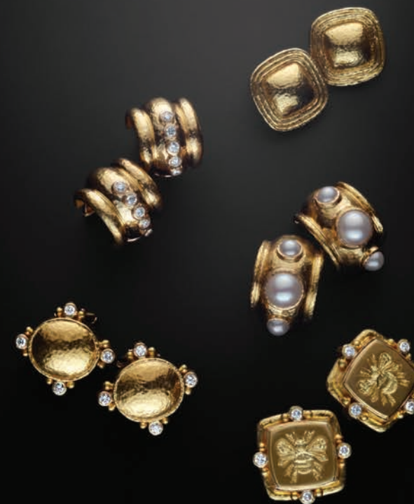
Gold Square Dome earrings • ER 101631