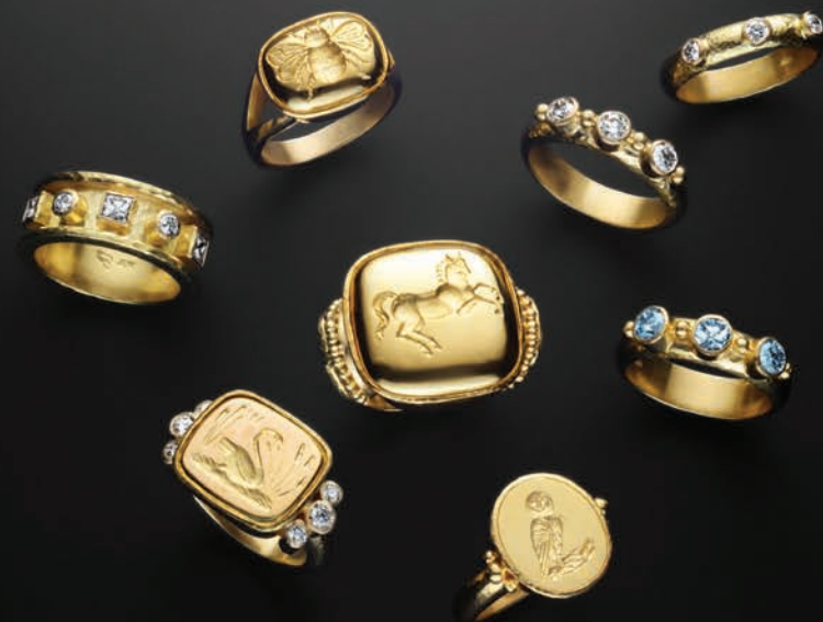
Gold Bee ring • R 18144