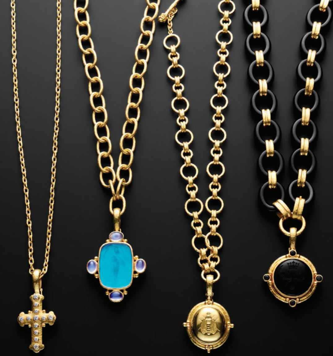
Very Fine chain with diamond Byzantine Cross pendant • N 5953 & P 66628