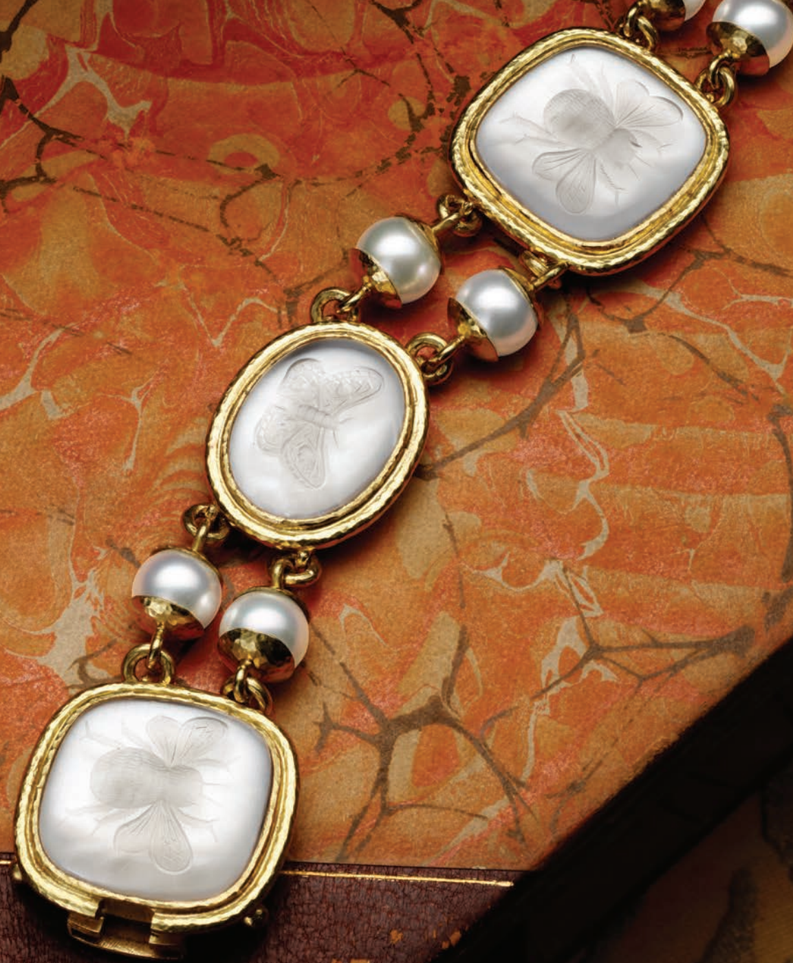
Gold Queen Bee bracelet • BR 99129