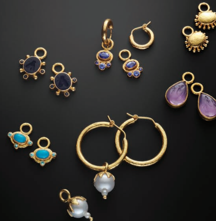
Black Venetian glass intaglio earring pendants • ERP 90786-B