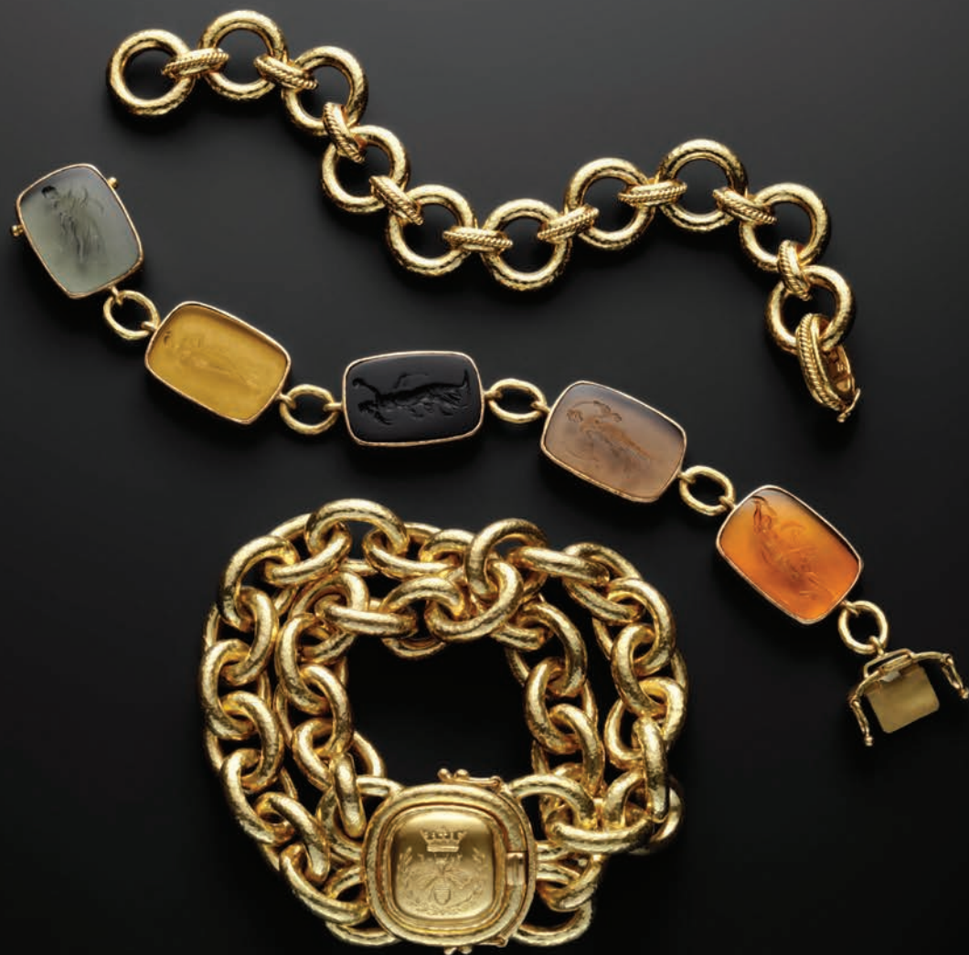
Gold Ravenna link bracelet • BR 105742