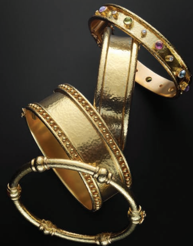
Tutti Frutti bangle • BR 99158