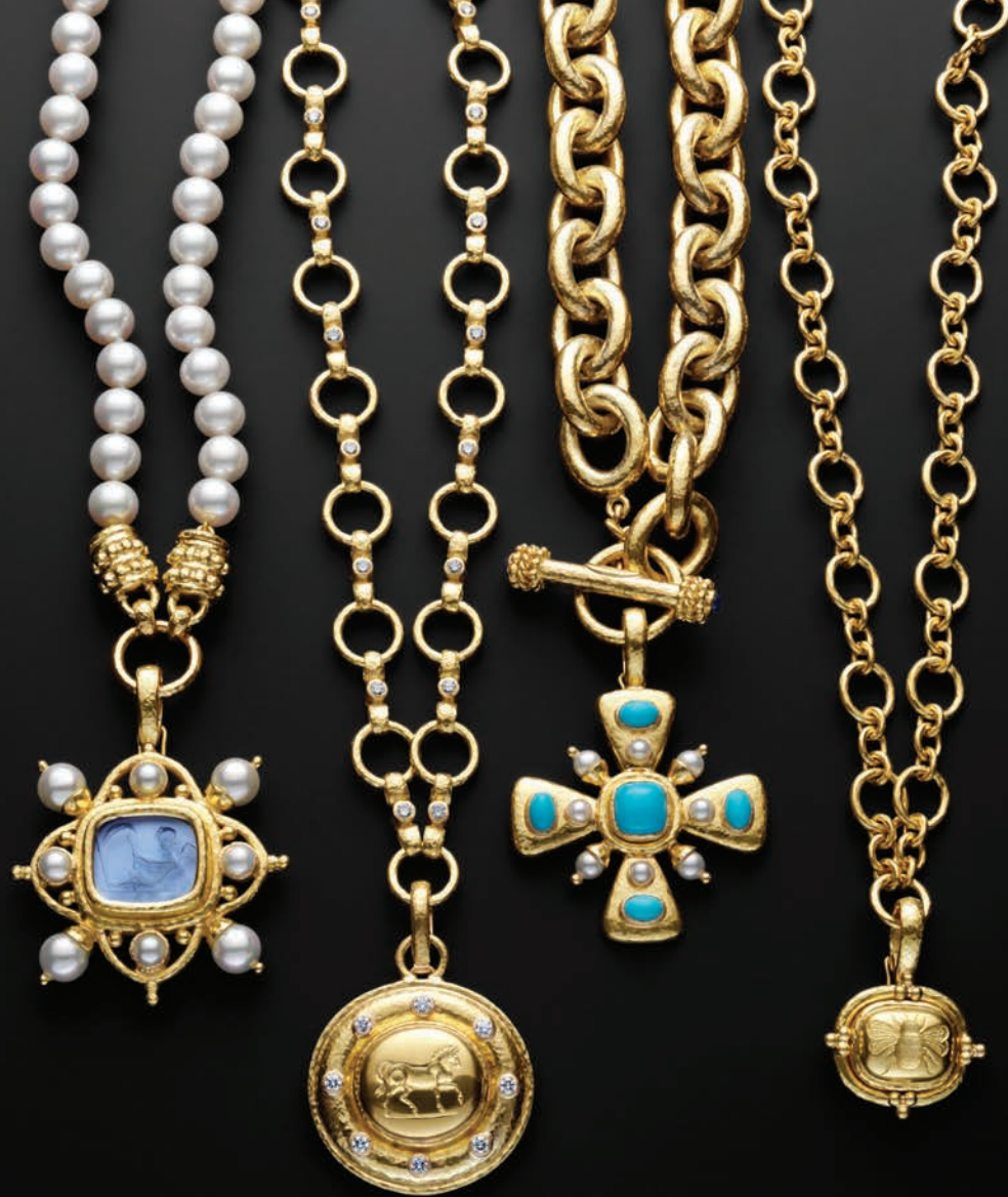
Pearls with Bettina clasp with cerulean Venetian glass intaglio pendant • N 105442 & P 100322-L