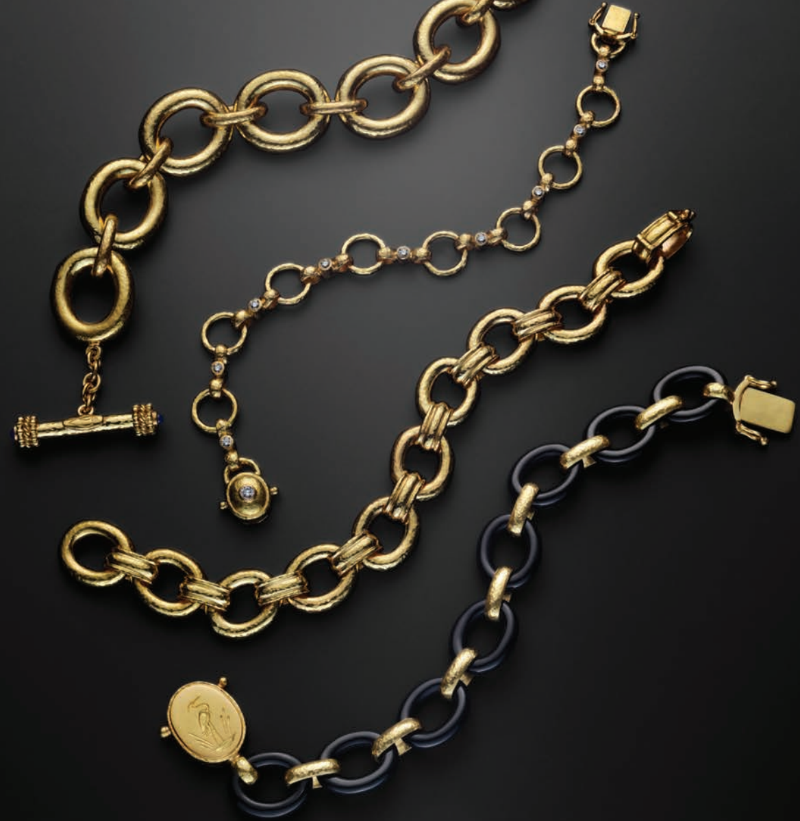
Gold Padova bracelet • BR 56518