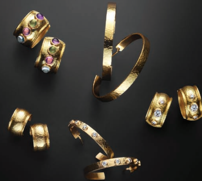
Tutti Frutti hoop earrings • ER 56503