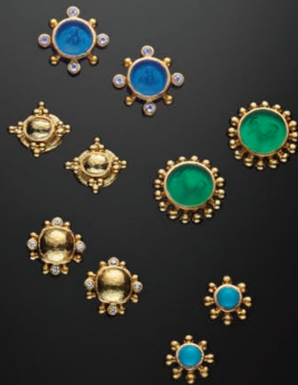
Peacock Venetian glass intaglio stud earrings • ER 91657-O