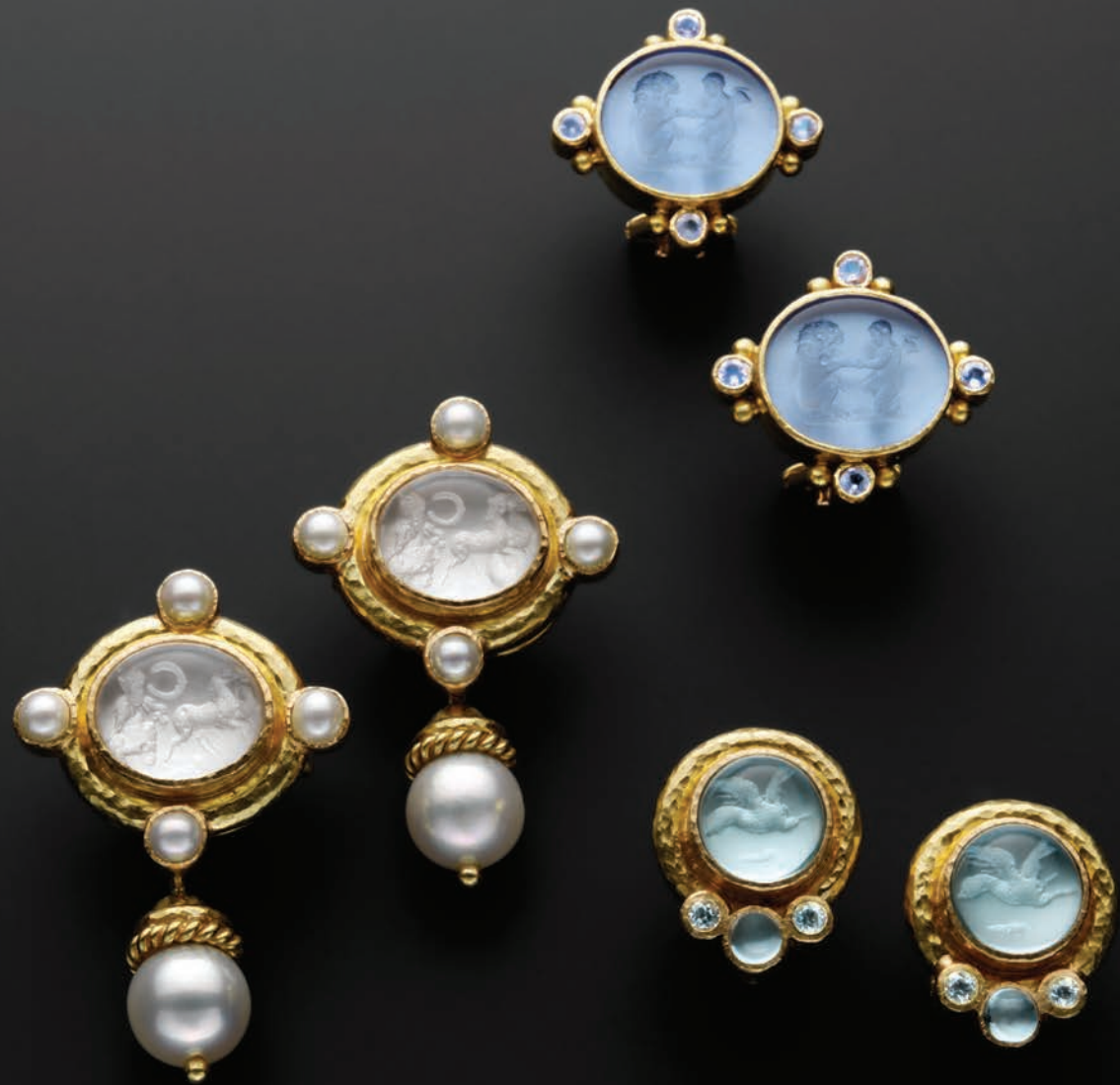
Cerulean Venetian glass intaglio earrings • ER 104097-L